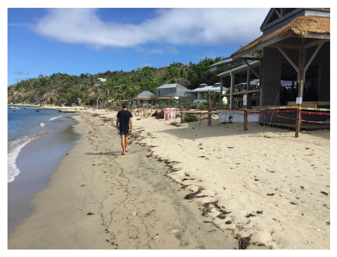
Day 1 sailing Hodges Creek – Nice bay on south of the Cooper Island