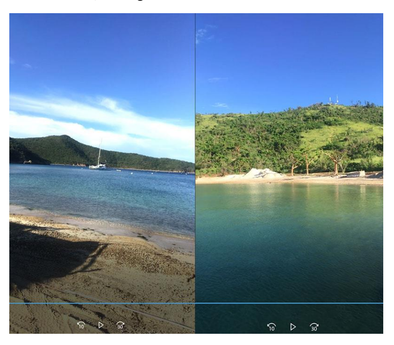
Day 8 sailing

Norman Island – Back to base, Hodges Creek